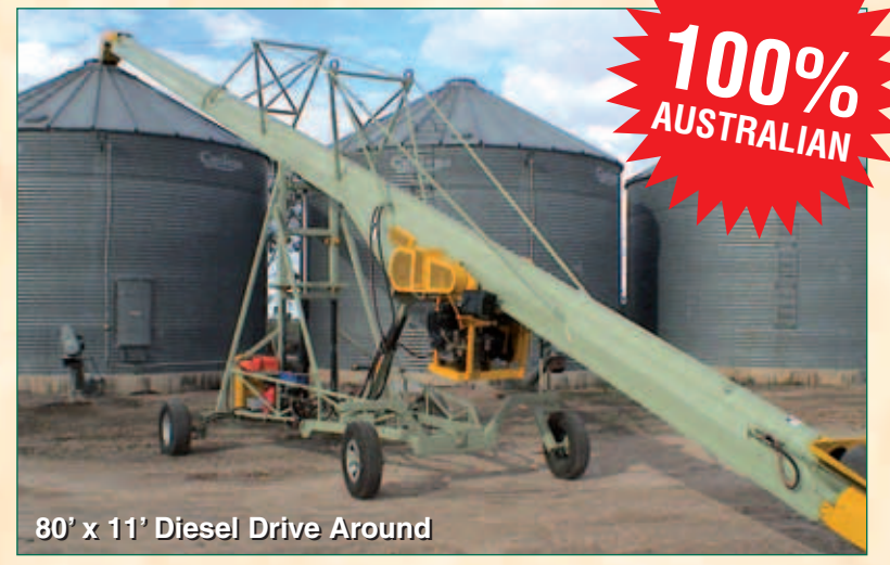
FROM 30'TO 100' LONG